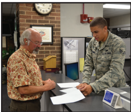
87 APS Airman at work