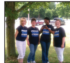
Wing PHAP supports PTSD Awareness Day

445TH AIRLIFT WING/PA BUILDING 4014, ROOM 113 5439 MCCORMICK AVE WRIGHT-PATTERSON AFB OHIO 45433-5132