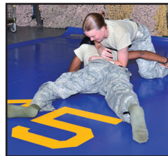
445 SFS practices combative security forces self-defense